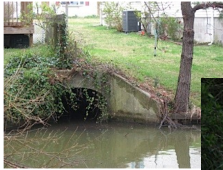
Left: Storm drain at Stockley Street where one of two stormceptors was installed.