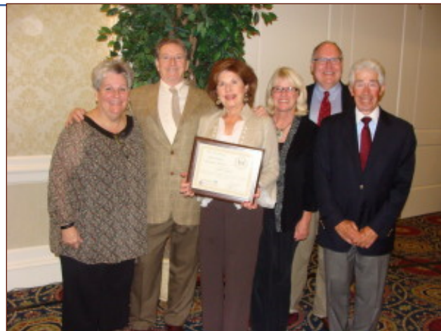
SOLA3 Board of Directors