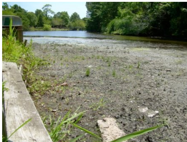
Sediment at west end of Silver Lake.

The Department of Natural Resources and Environmental Control (DNREC) is investigating an alternative project to resolve sediment deposition issues at Silver Lake Rehoboth at the westerly finger of the lake. Originally designed as a dredging project with upland disposal temporarily taking place on school property, the project was bid last year. Only one bid was submitted, and it greatly exceeded the project estimate and budget.