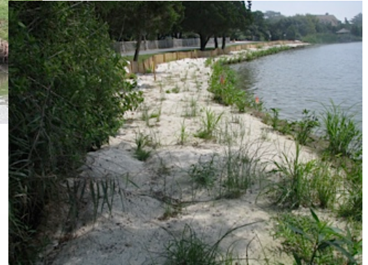
Right: 425 feet of restored shoreline and roadway along Silver Lake.