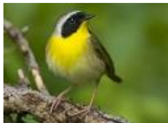
Great Black-backed Gull, left and Common Yellowthroat.

When November rolls around bird activity on Silver Lake picks up appreciably. The flocks of Mallards and Canada Geese grow exponentially with the arrival of additional local birds and migrants from Canada. It is not unusual to find hundreds of mallards loafing around the northern end of the lake. Mixed in, birders often also find a variety of other ducks including American Black Duck, Northern Shoveler, American Wigeon and Green-winged Teal.