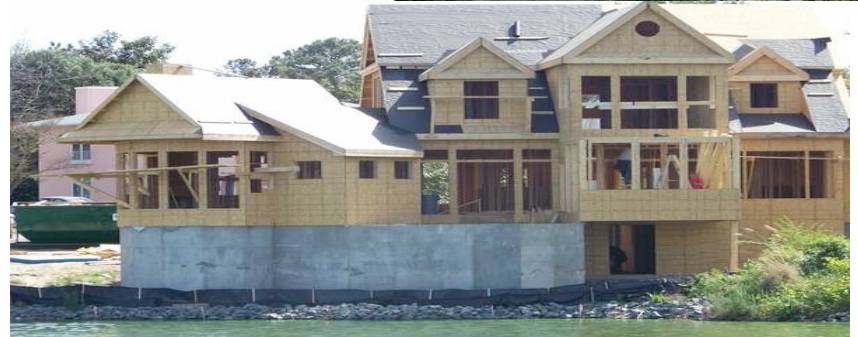
Above: The house on Silver Lane which SOLA3 tried to curtail.