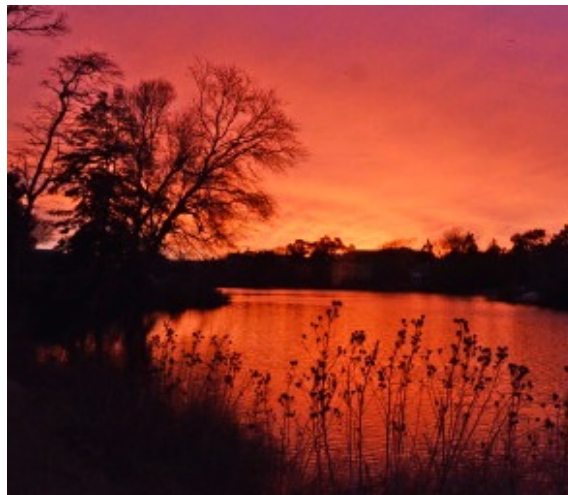
Lake Comegys at sunrise and a very large turtle who makes its home there.

Rehoboth Beach Home Owners' Association Lake Comegys Home Owners' Association Draper Subdivision Home Owners' Association