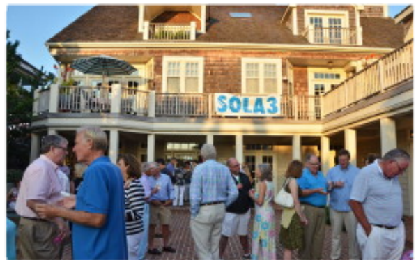
A good time was had by all.