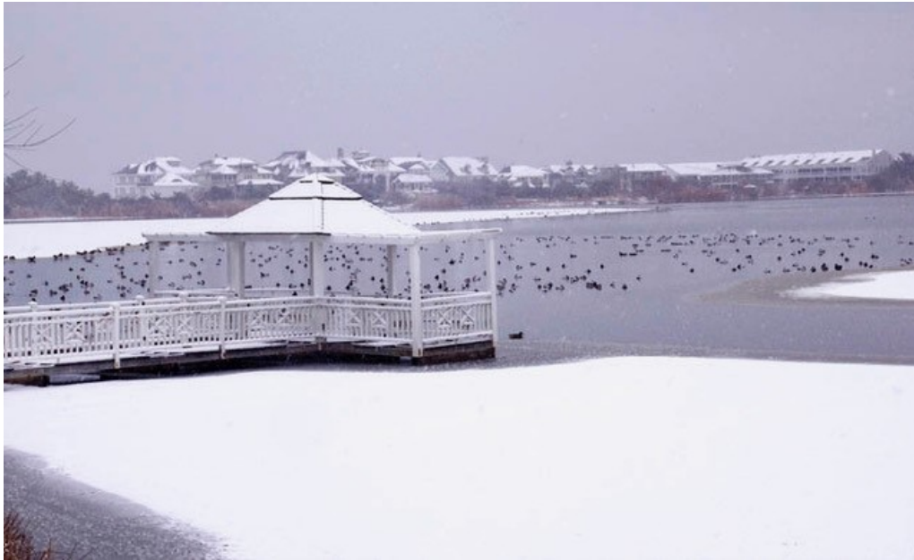
Silver Lake in Winter of 2018