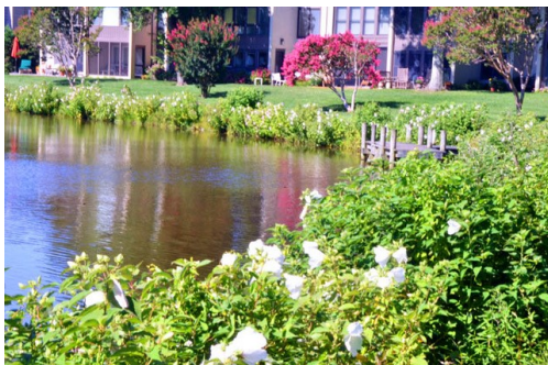
A beautiful shoreline created with a riparian buffer at Lake Comegys

This is a unique opportunity to receive financial assistance to improve your property and also improve the health of the lakes. So don't wait – ACT NOW!