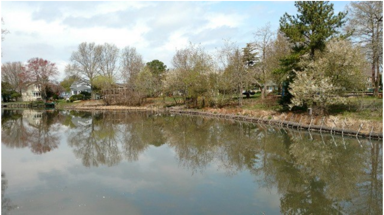
New Shoreline and Dredged Chanel at West end of Silver Lake

Staff from the Shoreline and Waterway Management Section will continue to monitor the containment cells for vegetation. Last year a healthy population of Bulrush had become established in both cells. If the Bulrush continues to flourish, no additional wetland vegetation will be planted in the cells. However, monitoring will continue to ensure any unwanted vegetation, such as Phragmites, does not become established in the containment areas.