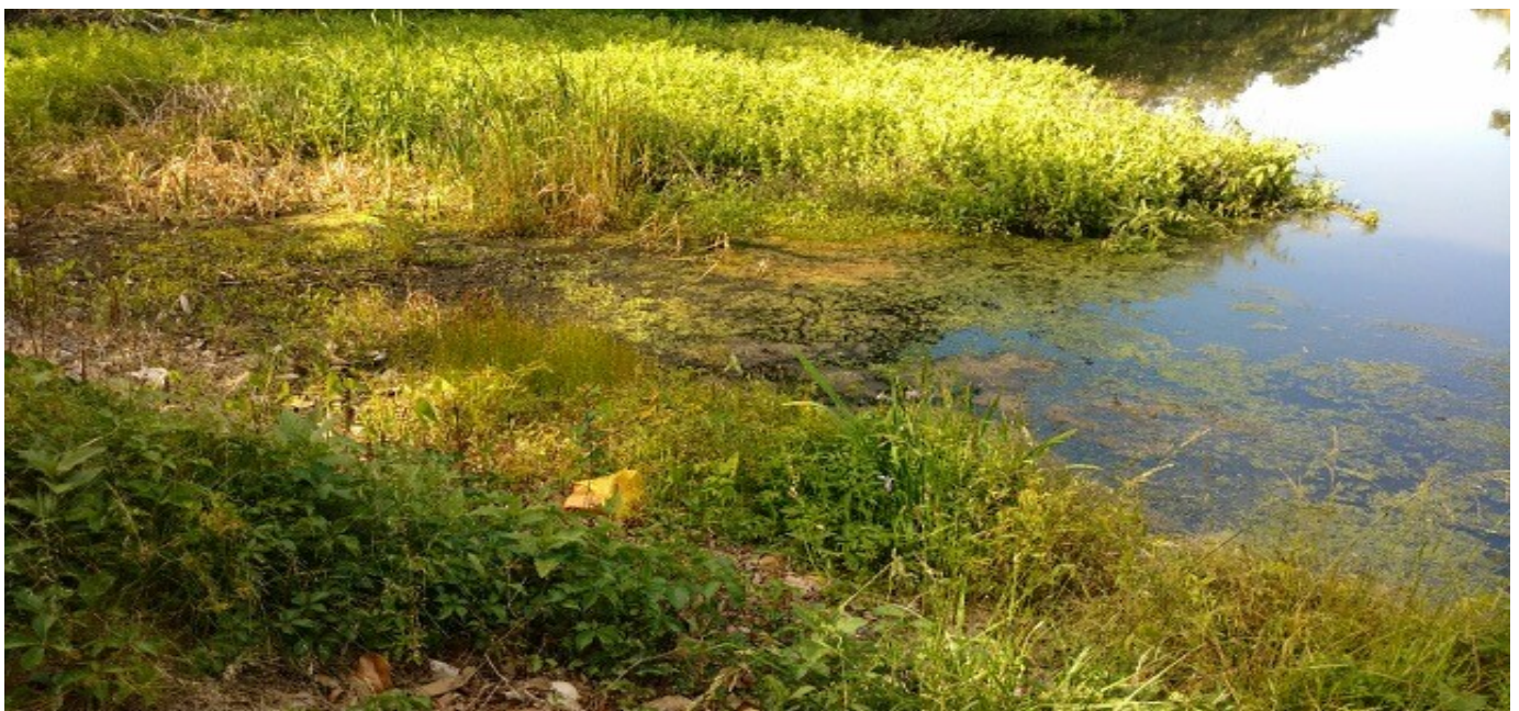
Deplorable Conditions at West End of Lake Gerar

But even with the deferment there is good news! The Commissioners initiated a line item specific to Lake Gerar health needs in the City’s 5-year capital improvement plan with anticipated funding in the 2019-2020 budget of $53,000. The intention by the Commissioners is to build onto the original funding in future years to ensure sufficient funds for Lake Gerar improvements when ready.