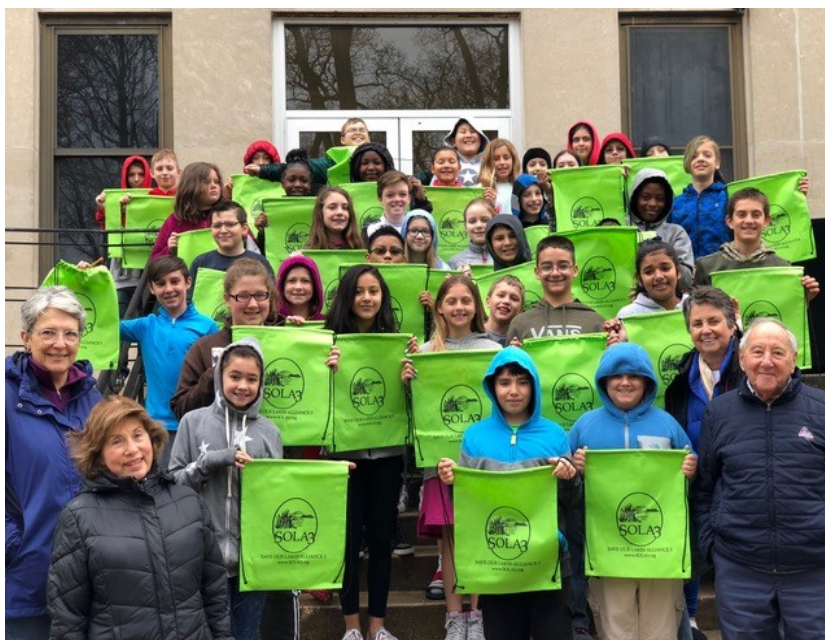
5th grade Rehoboth Elementary School class who participated in class, along with volunteers